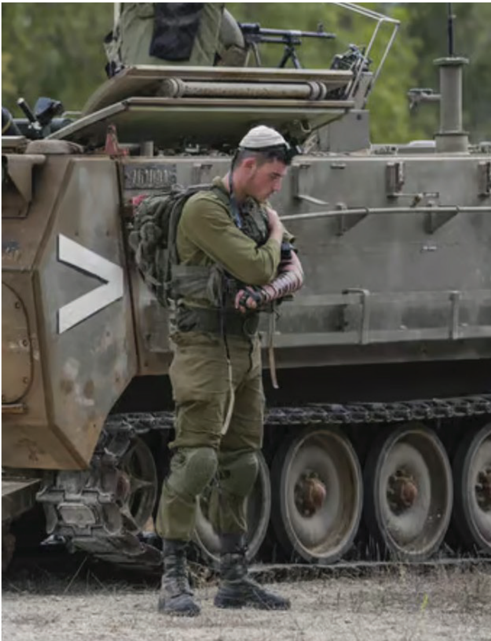
A soldier puts on tefillin near the Gaza Strip border on October 9