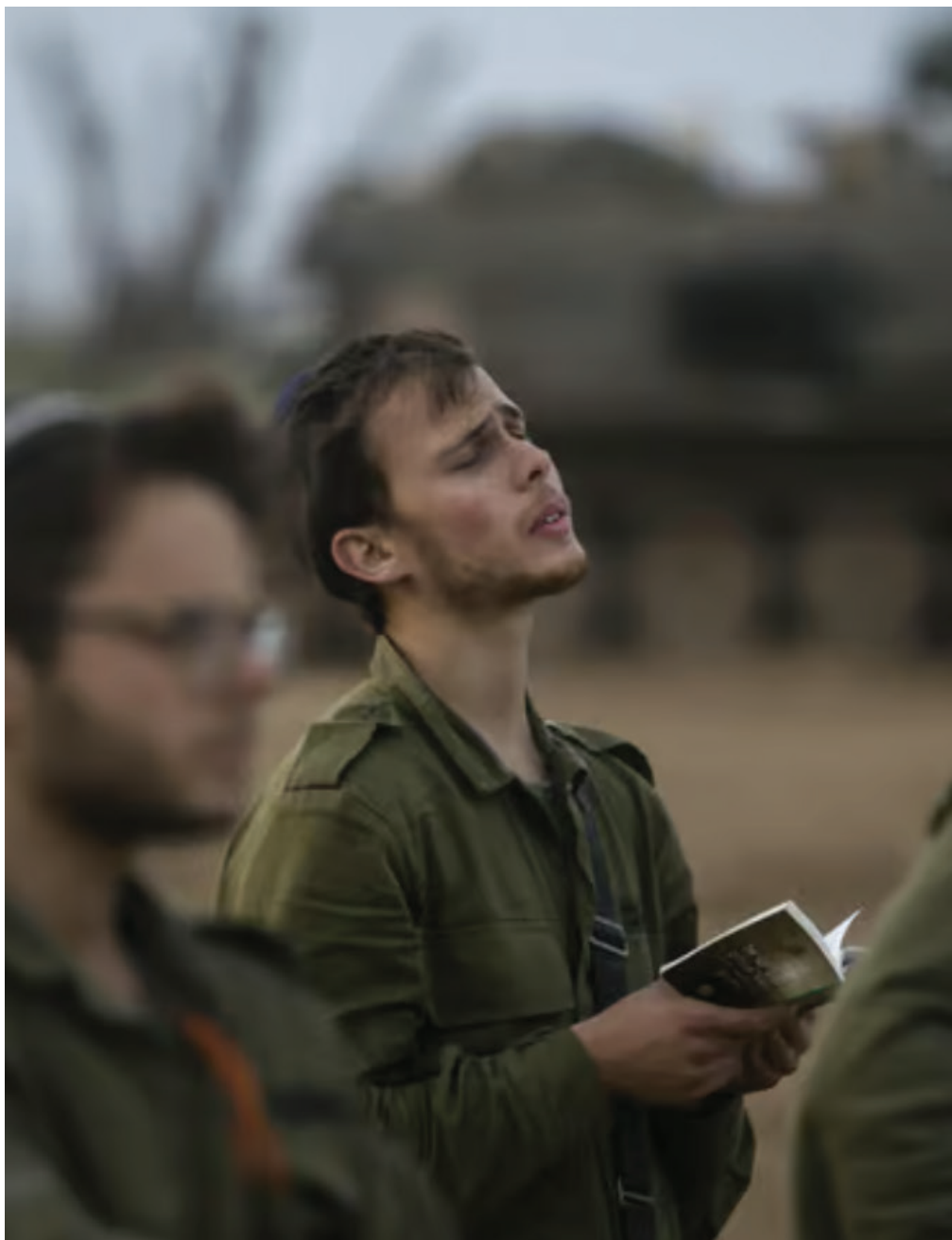
Prayer near the Gaza Strip border on Hanukkah.