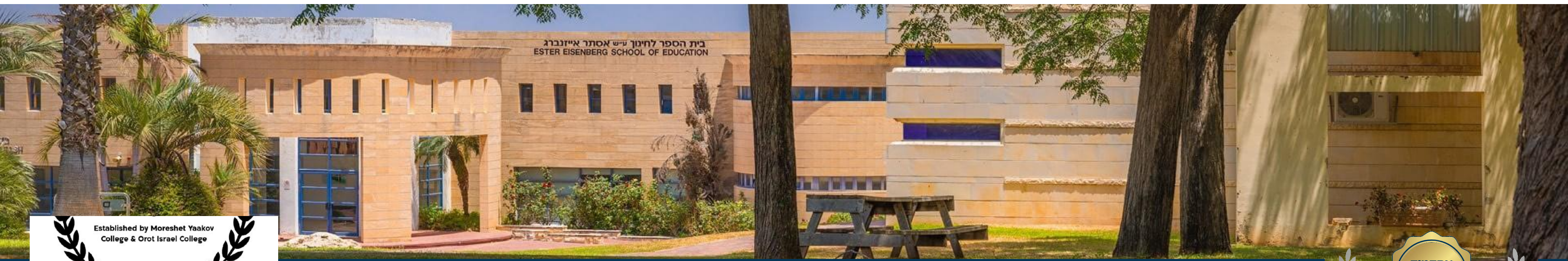
בית הספר לחינוך ע"ש אסתר אייזנברג ESTER EISENBERG SCHOOL OF EDUCATION

history in Israeli schools. Additionally, the teachers will gain new perspectives and research tools, allowing them to expand this field of knowledge and develop new teaching resources integrating the historic perspective with Jewish values, historiography, and traditional Torah sources.